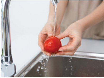
Vegetables / Fruits Cleaning